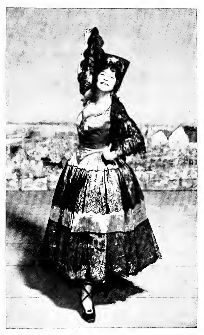
LA ARGENTINA